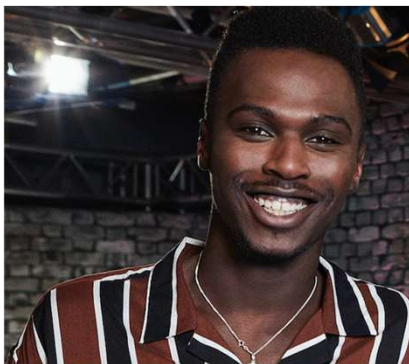
Mo Jamil (Winner of The Voice)