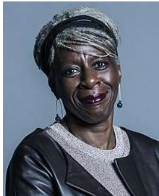
Lola Young (Baroness in House of Lords)